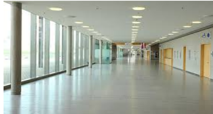
Messe Freiburg Latihan Hall